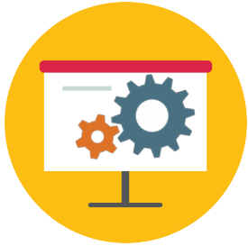
Artificial intelligence and machine learning