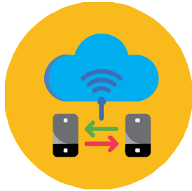
Cloud-based infrastructure and solutions