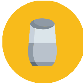
Natural language processing, voice technologies