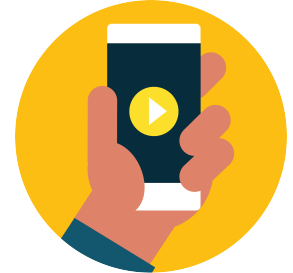
Web and mobile